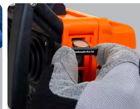
radiomatic® iLOG for the quick activation of a spare transmitter