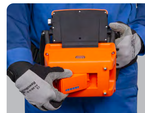
High-performing Li-ion exchange batteries with capacity gauge