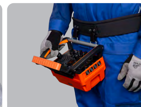
Convenient carrying with the hip belt