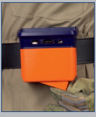
Change the battery within seconds