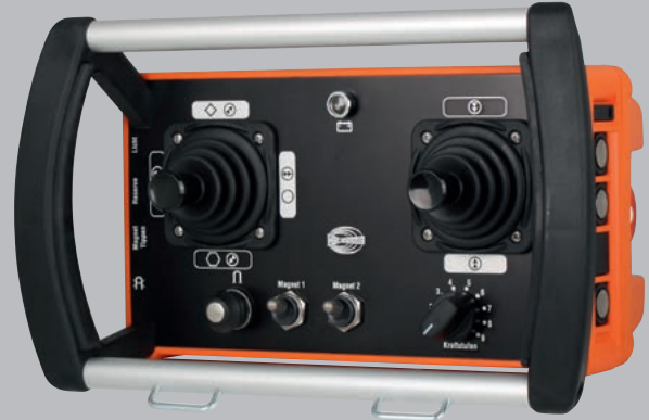
Version for industrial cranes.

Diverse cranes, lift equipment, machinery and many more.