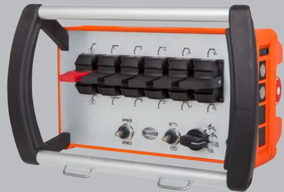
Version for hydraulic applications.